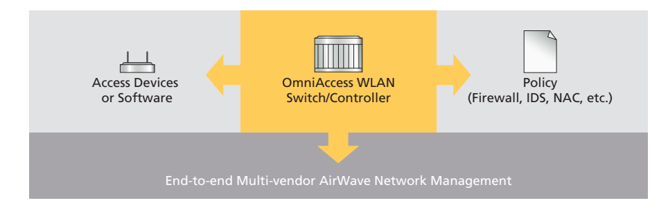
Figure 1. Alcatel-Lucent OmniAccess WLAN Switch/Controller in network configuration

requirements than corporate head-quarters. And even within a corporate campus, some organizations value a centralized traffic-forwarding model where all network traffic flows to the data center, while other organizations need a more distributed approach. The unparalleled OmniAccess Wireless Base Software flexibility permits all these permutations and more, adapting the network to the requirements of the organization rather than dictating rigid design specifications (see Figure 1).